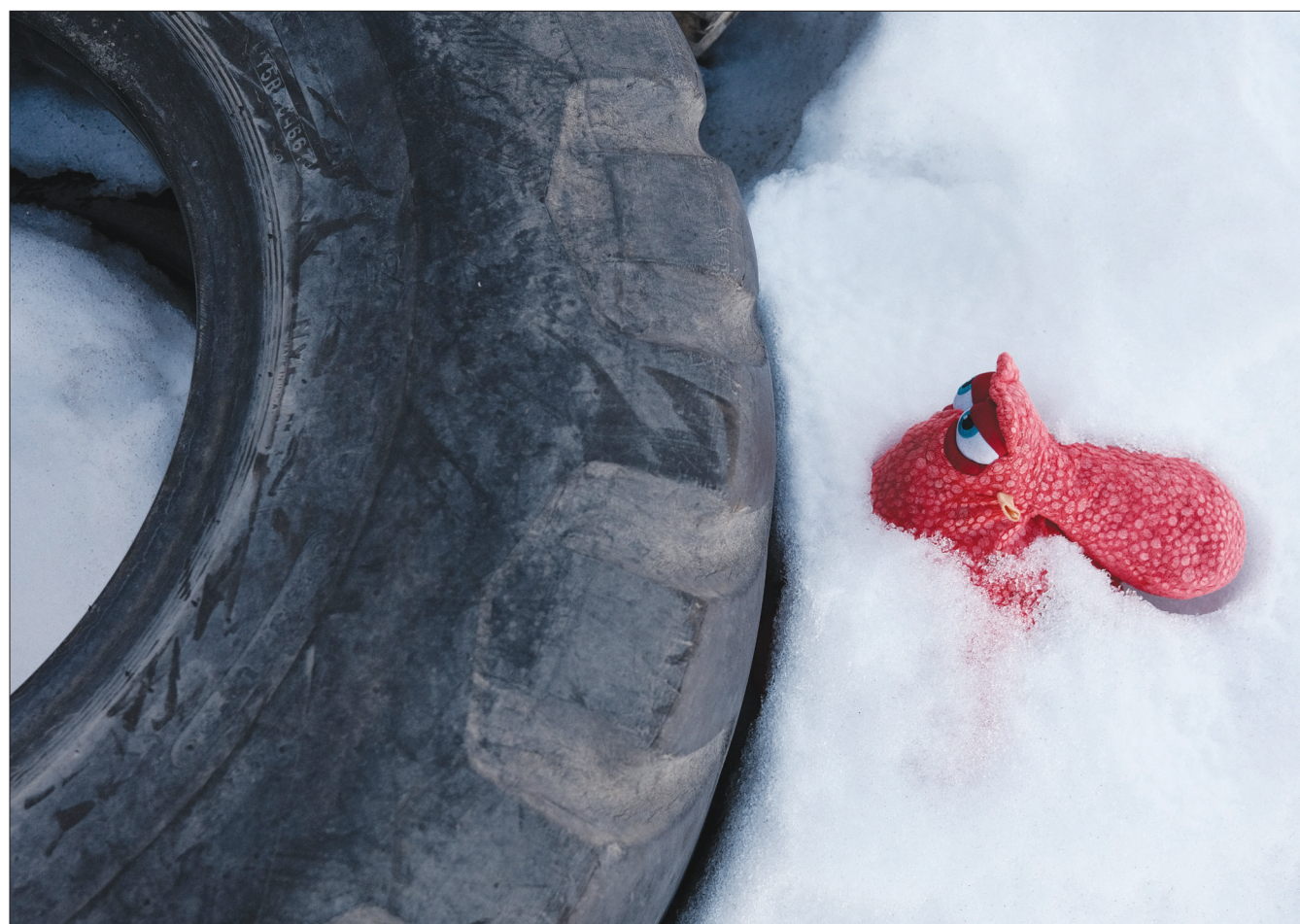
Melting snow uncovers a hidden octopus toy Monday, March 1, 2021, near the Union Pacific Railroad by Adams Avenue in La Grande.