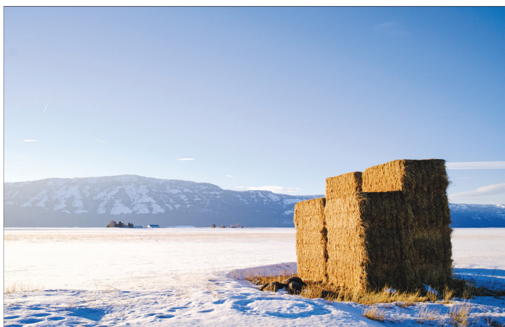
Hay bales amidst melting snow in the evening along Highway 82, north of La Grande Monday, March 1, 2021