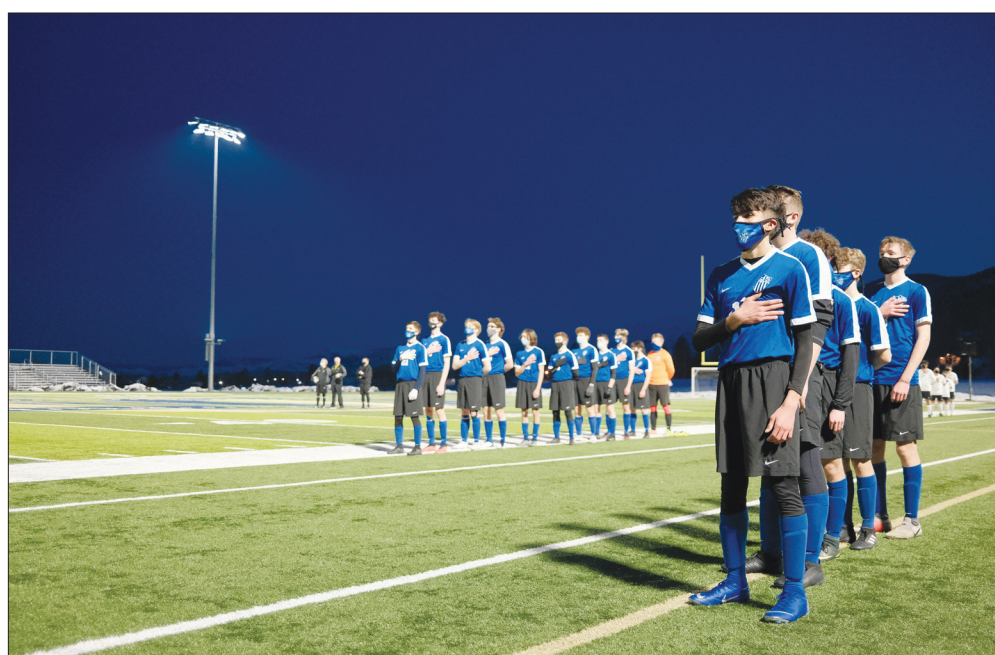
Members of the La Grande High School varsity soccer team stand at attention Tuesday, March 2, 2021, for the "The Star-Spangled Banner."