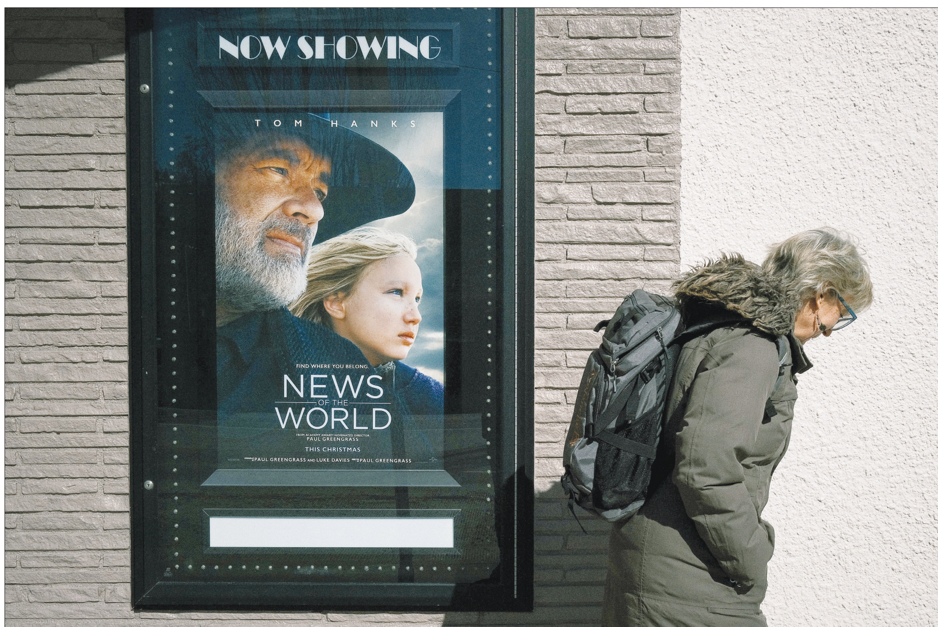
A woman walks past a movie poster outside the Granada Theater, La Grande, on Monday, March 1, 2021. The theater opened Friday, Feb. 5, after a several month hiatus due to the pandemic.