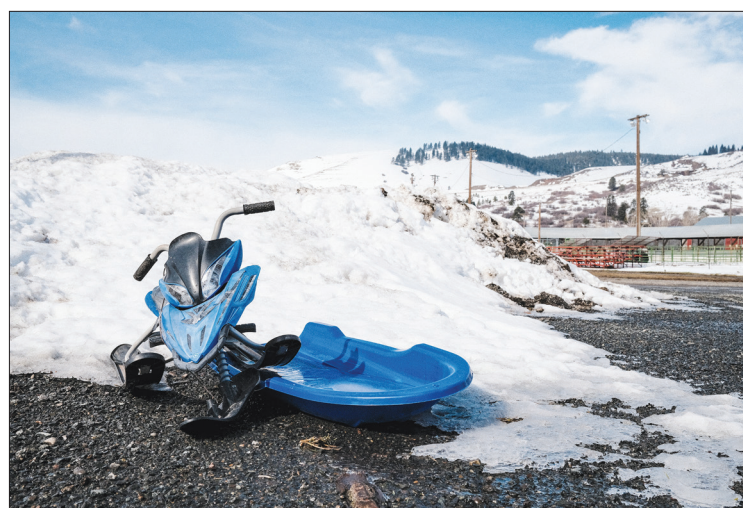
At left, a child's sled rests in the snow at the Union County Fairgrounds, La Grande, on Thursday, March 4, 2021.