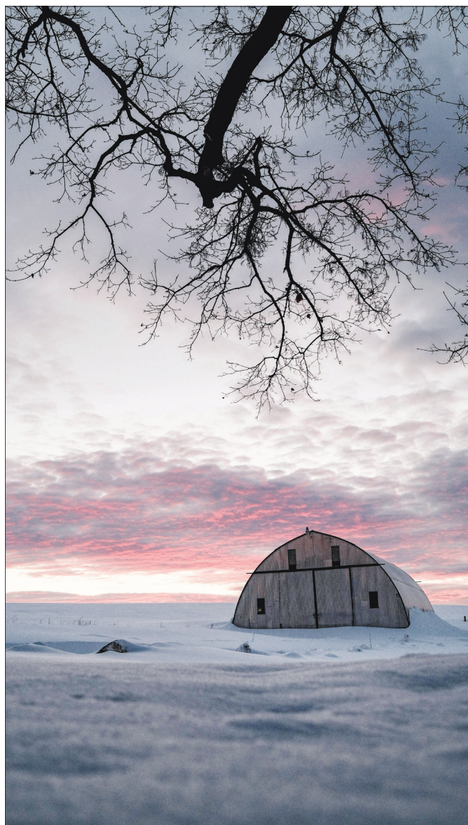
At left, sun sets over a barn near Elgin on March 1, 2021.