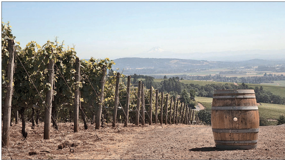
A barrel and vines at White Rose Estate, Dayton. The wine, beer and cider industries are bracing for a potential tax hike in Oregon.