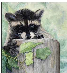
The annual Little Art Show in Baker City showcases 8-inch-square works of art, like these from last summer's show.