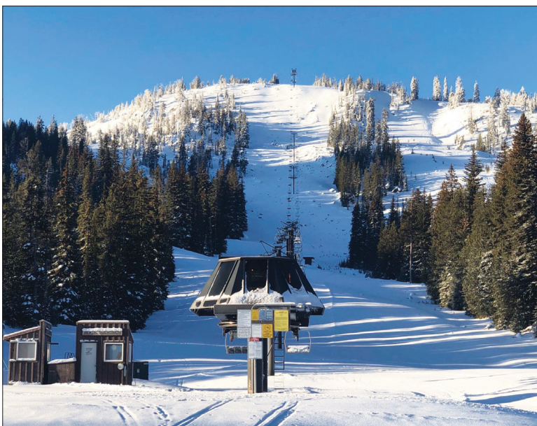
Skiers and snowboarders will notice changes this winter at Anthony Lakes Mountain Resort, which will reduce capacity in the lodge and in other buildings due to the coronavirus pandemic.

"We have a business to run, and it's not a discussion point,"