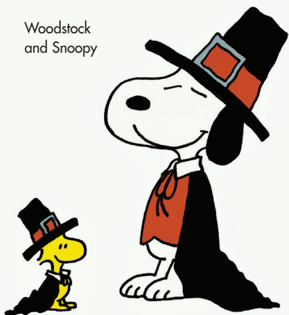
Woodstock and Snoopy