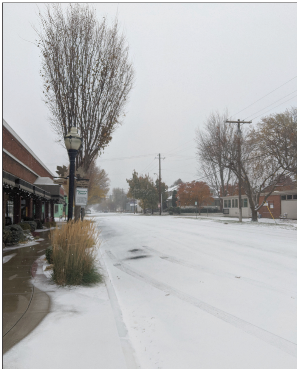
Snow covers Fourth Street near downtown La Grande after the first snowfall of the season that stuck around Sunday, Nov. 8, 2020. The National Weather Service out of Pendleton has forecasted a mix of rain and snow for Tuesday, a chance of snow Wednesday and partially sunny weather Thursday. Snow, however, has a chance of returning Friday.