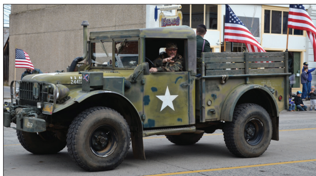
The Observer, File

La Grande Unit 43 Auxiliary has traditionally