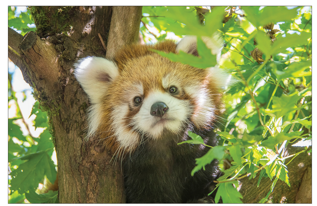
Mei Mei's red panda cub, newly named Pabu, explores his habitat at the Oregon Zoo.