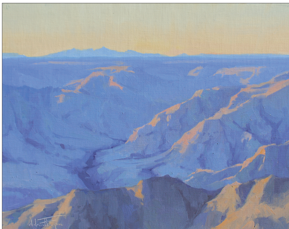
Artist Melanie Thompson painted "First Light, Hells Canyon," oil on panel in 2019. The painting is an example of what will be available at the Wallowa Valley Festival of Arts' upcoming online auction.

The online auction will go from Sept. 11 to Sept. 30. Winning bidders must make arrangements for pick up or shipping.