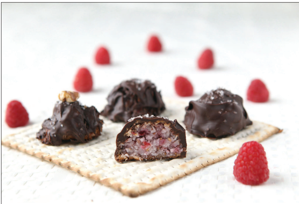
Hillary Levin / St. Louis Post-Dispatch

Per serving: 391 calories; 28 g fat; 15 g saturated fat; 113 mg cholesterol; 6 g protein; 37 g carbohydrate; 24 g sugar; 3