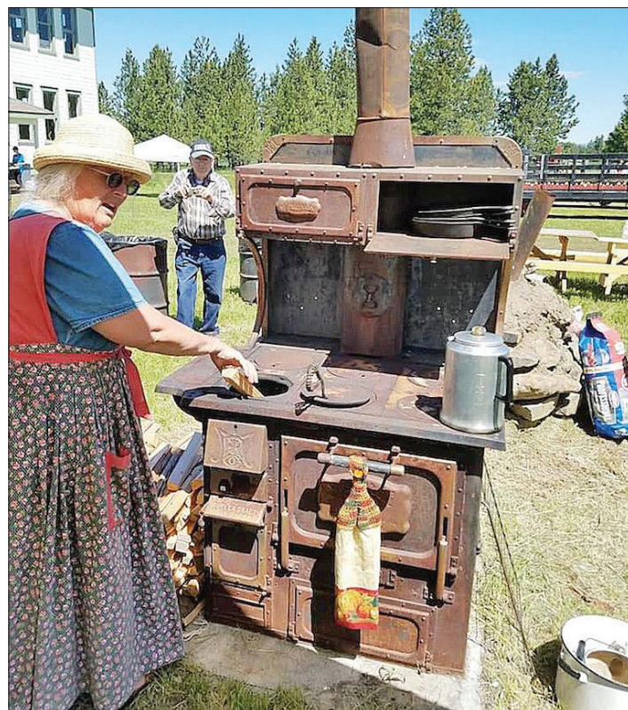
Pioneer demonstrations and activities are featured during Flora School Days 2019. The annual event helps raise money for the Flora School restoration project and to highlight the folk arts. The school moved the 2020 celebration online to the school's Virtual School Days 2020 group Facebook page.

The school is about 35 miles north of Enterprise in Flora and close to the border of each state. The school will reschedule classes and activities into 2021.