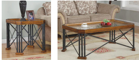
Cocktail plus 2 ends