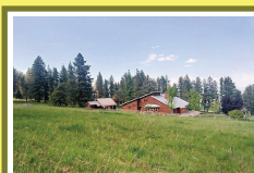
82479 Boner Lane Enterprise $529,000

3BR 2BA home on 10.37 acres with Marketable timber - tree farm. New kitchen flooring. 2 car garage w/ shop area, and large lean-to off the side. Two carports and 3 storage sheds. MLS#18370158