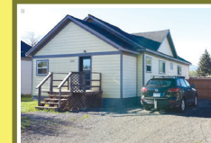
506 W Main St., Enterprise $199,999

Elegant living on .85 acre with 100 ft. of Wallowa River frontage. 3 bd. 2 ba. - 3400 sq.ft. home. Updated & restored with magnificent landscaping. 10' ceiling height, 400 SF Master Bd., Red Fir & Oak Flooring. MLS#19587384