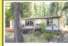
59640 River Canyon Road Imnaha $119,500

156.6 Acres up the Imnaha River on Freezeout Road. Great hunting and recreational property with access to the Snake River and Hells Canyon nearby. MLS#15510828