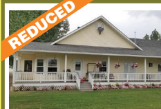
75403 Upper Diamond Ln Wallowa $489,000

Beautiful custom crafted building, truly one of a kind. All set up ready for your restaurant/bar or vacation rental. Great Joseph location, spectacular mountain views from the upstairs outdoor dining area. Immaculate grounds with private settings. MLS#19410542