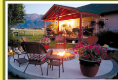
84142 Alpine Ln., Joseph $539,999

Location, views, private, custom house, elk in your front yard. This 3 bed 3 1/2 bath home sits on 6 acres with a separate log cabin bunk house with full bathroom. Main house has a stone fireplace and nice loft, full basement with it's own entrance. It's difficult to describe all the great features this property has. MLS#19002437