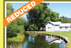
381 Alder Street Elgin $239,995

2 bdrm 2 ba totally remodeled. State of the art kitchen, huge walk in pantry, fenced back yard with greenhouse and chicken coop. Possible room for a 3rd bdrm in basement with approval. MLS#18476755