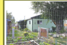
903 S College Street Joseph $219,000

2 story, 1822 sf home on 2+ acres with Grande Ronde River frontage. Fenced pasture, pond, mature shade trees, shop 1536SF. Hay shed/machine shed. 4 BD., 2BA. 744SF separate office room + family rec./entertainment room. MLS#19677350