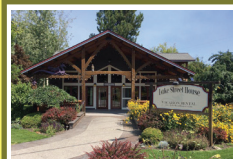
300 N Lake Street Joseph $489,000

Beautiful custom crafted building, truly one of a kind. All set up ready for your restaurant/bar or vacation rental. Great Joseph location, spectacular mountain views from the upstairs outdoor dining area. Immaculate grounds with private settings. MLS#19410542