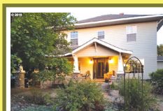
400 Fish Hatchery Lane Enterprise $387,000

Beautiful setting on the Imnaha River with a 3 bedroom, 2 bath home. This could be a great get-a-way home or an excellent year around home. There is plenty of deer, elk, bear and game birds plus good fishing. A rustic wood storage shed. MLS#16093188