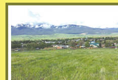
0 Sagewood Street #2 Enterprise $97,000

3 bdrm, 2 ba, good storage. Attached garage with lots of storage. Certified wood stove and electric wall heaters. Garden spaces front and back. Mountain views. MLS#19598585