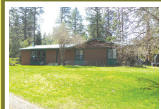
64080 Spring Creek Rd., Enterprise $375,000

2070 S.F. home on 5 irrigated acres. 3 BD 2 1/2 BA. Hardwood floors 1000 KW Solar System. Propane Furnace, F/P, range. Detached double garage/shop w/certified wood stove. Garden area, pasture, pole barn/hay shed/machine shed Wood Barn. Green house, graveled fire pit. MLS#19057509