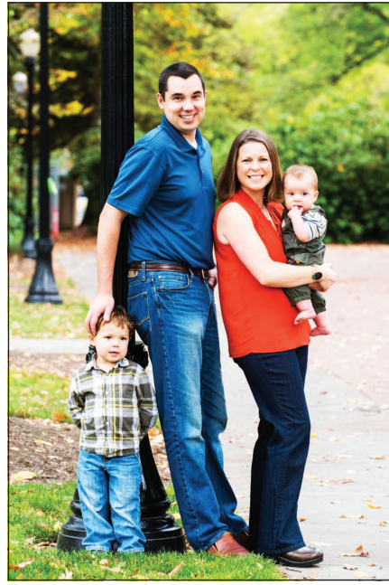
Tish Battaro of Powers Photography

■ Fundraising event scheduled for Reser Stadium in Corvallis to benefit La Grande native Stephanie Raleigh and her husband, Seth, who was diagnosed in 2015 with stage three anaplastic astrocytoma, a type of brain tumor with cancerous cells