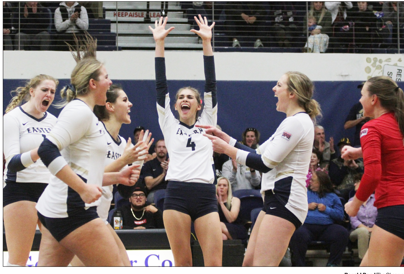
The Eastern Oregon volleyball team celebrates a point during the third set Friday against Corban. The No. 5 Mountaineers rallied from two sets down to knock off the No. 7 Warriors, 16-25, 24-26-, 25-11, 25-16, 15-6.