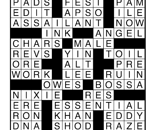
7-29-19 © 2019 UFS, Dist. by Andrews McMeel for UFS