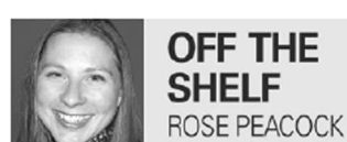
OFF THE SHELF ROSE PEACOCK

The Museum of Natural and Cultural History present "Our Place in Space" on June 27 at 11 a.m. Science experiments and fun activities explore what makes planet Earth special. Family