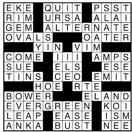
4-13-19 © 2019 UFS, Dist. by Andrews McMeel for UFS