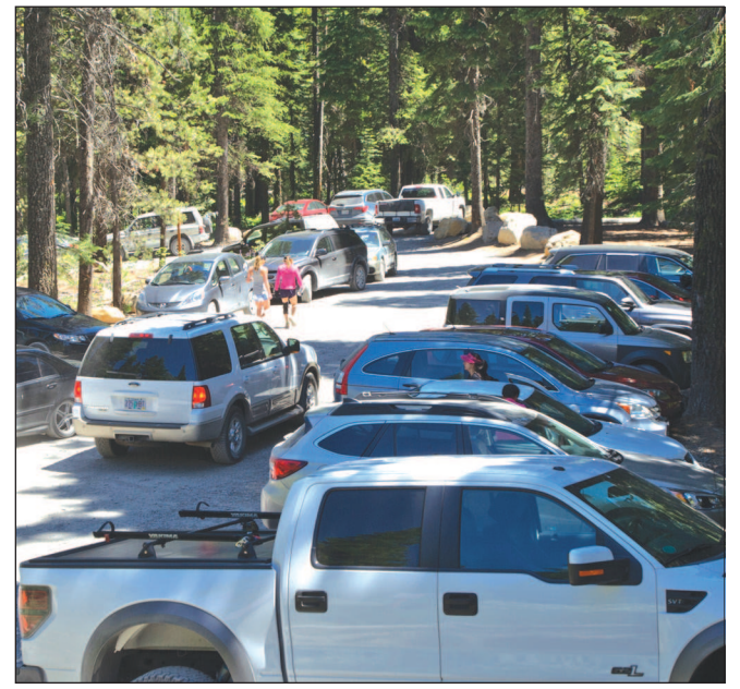
Cars and pedestrians navigate through the busy Tumalo Falls parking lot in Central Oregon. Courtesy Photo

Smaller state park campgrounds also saw big growth, from Viento in the