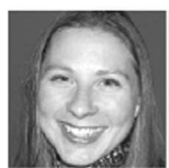
OFF THE SHELF ROSE PEACOCK

The next Page Turners book club for adults will be held at 1 p.m. Jan. 8 in the Archives Room. The book for January is "Wolf Willow" by Wallace Stegner. A collection of essays and fictional stories of Stegner's childhood in Saskatchewan in the early 20th century, "Wolf Willow" illuminates pioneer life and the magnificent landscape.