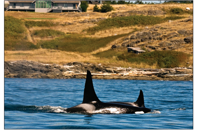
WesCom News Archive

With the whale not close by, crews did a practice run for the feeding, sending salmon through a turquoise tube off the back of a boat. Researchers with the Whale Sanctuary Project took a sample of the fish scales so they can later genetically track whether the whales consume that fish, while other crews with the Lummi tribe scooped the salmon out of a large bin and sent it into the water.