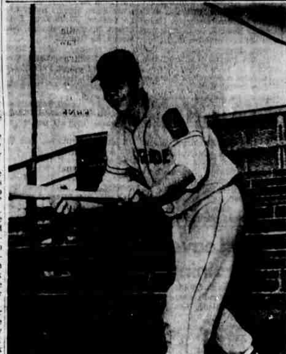
HITS IN CLUTCH

Observer, La Grande, Ore., Thurs., June 9, 1960 Page 2