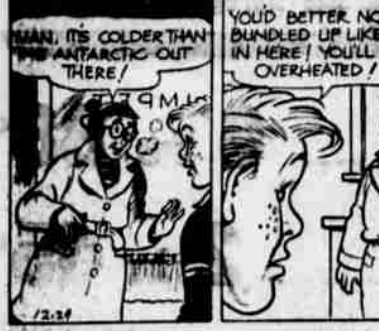
PECKLES AND HIS FRIENDS