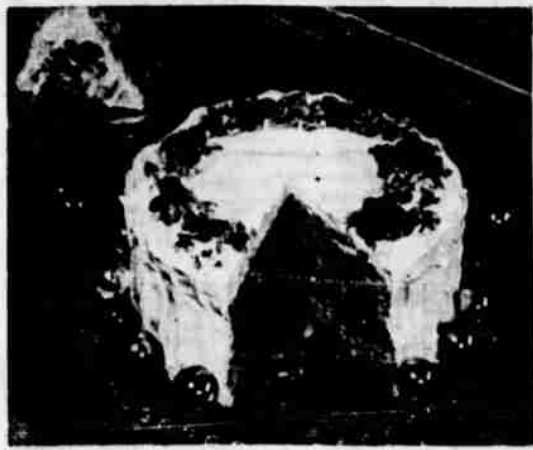
CHRISTMAS CAKE (Makes 8-inch Layer Cake)