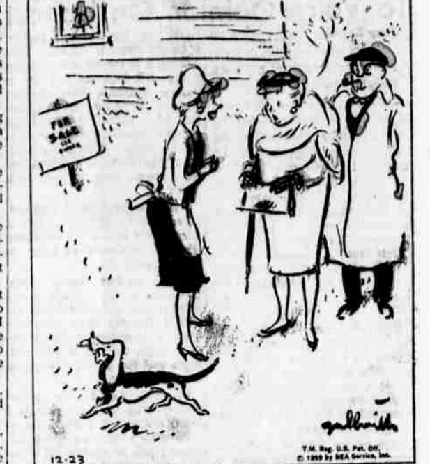
"This is a very high-class neighborhood. You should see the steak bones our dog collects!"