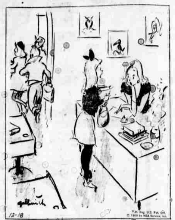
"If I were you I'd get married and stop worrying about the sixth grade!"