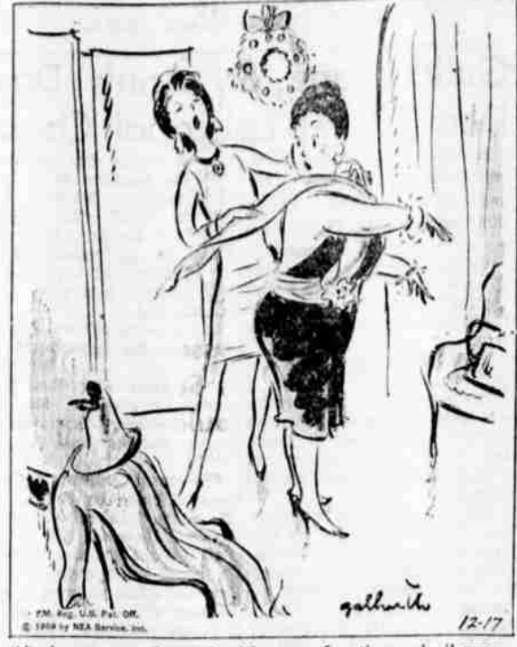
'And you can drape it this way for those devil-may-care occasions!'