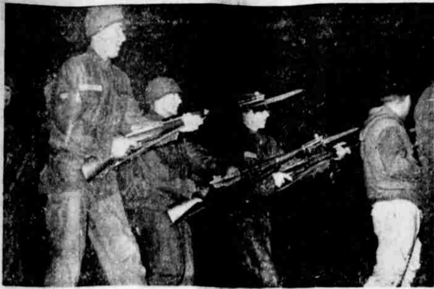
MARTIAL LAW —National guardsmen use fixed bayonets to dispose of a crowd of from 500 to 600 strikers who had massed in front of the Wilson Co. packing plant in Albert Lea, Minn. Martial law has been declared to end the rock throwing and other violence by the union demonstrators.

TO AIR POPE'S SPEECH VATICAN CITY (UPI)—Pope John XXIII will broadcast the annual papal Christmas message to the world at 6 a.m. e.s.t. on Wednesday, Dec. 23. Vatican sources reported the speech will be relayed through national radio hookups throughout the world.