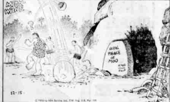
I GUESS I'M CAT ONE THING I AM SURE OF ...