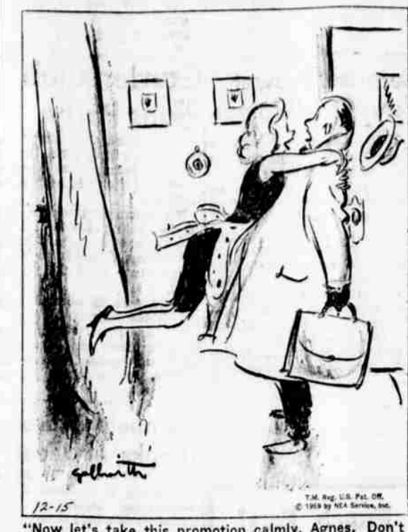
"Now let's take this promotion calmly, Agnes. Don't try to phone too many people on an empty stomach!"