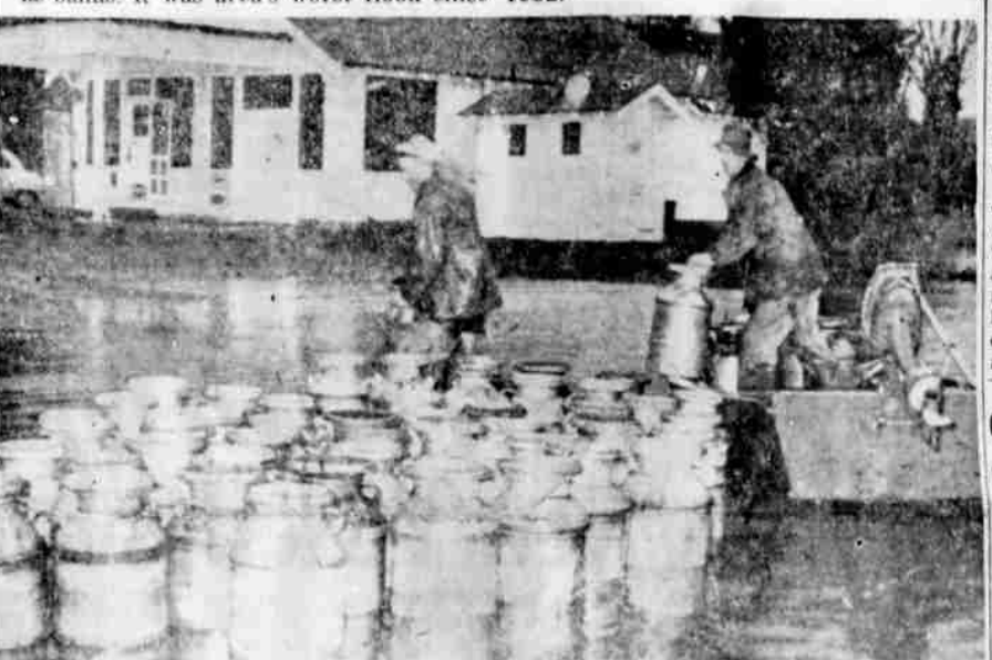
MILK RUN - Motor boat makes run at Snohomish, Wash., where rain-choked Snohomish river inundated low land farms and forced isolated dairymen to use this method of delivery. Several days of heavy rain followed by warm wind in the mount-

This picture was made during the peak of the recent flooding of various Washington communities and shows waters of the Green River covering highways and isolating farms on the outskirts of Kent. Many families were evacuated from their homes as a result of the melting snows and heavy rains that caused the river to break its banks. It was area's worst flood since 1932