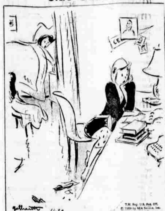
"Writing to a boy, I could understand—but getting up at 2 a.m. to study math just isn't NORMAL!"