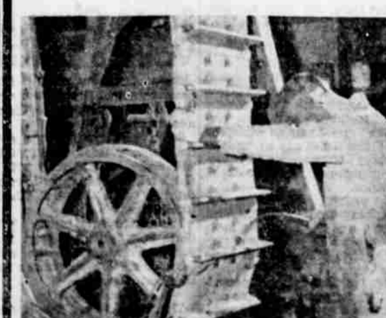
GROUSER BARS BEING INSTALLED... THE CUSTOMER SAVED OVER 60% OF NEW GROUSER PRICE—YET WILL GET 80% OF NEW LIFE!