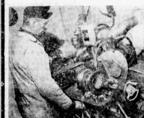
ALL ROLLERS ARE GRIND TO RIGID "NEW" ROLLER SPECIFICATIONS AFTER BUILD-UP.