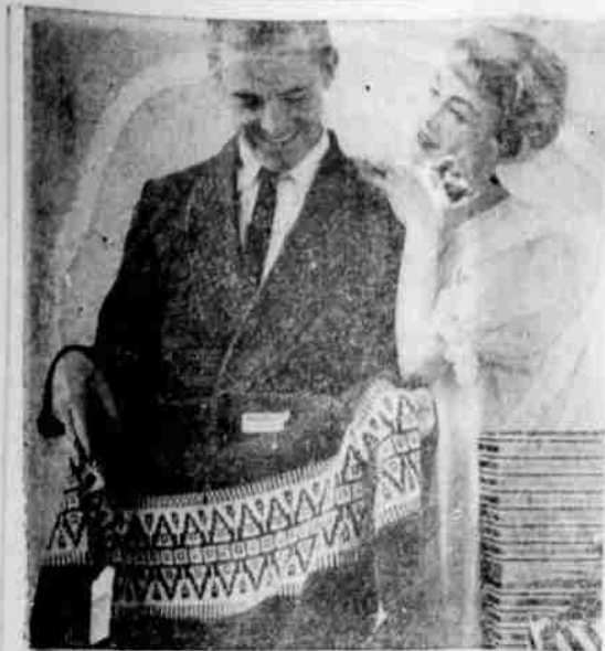
GIFTS HE'LL WEAR —The foulard patterned robe is wash and wear of "Dacron" polyester fiber and cotton in burgundy red with burnished gold. Waffle-stitched ski sweater of "Orlon" acrylic fiber can be hand or machine washed without danger of shrinkage. Handsome Scandinavian design.