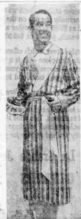
FOR THE MAN-A robe (above) to relax in, and the perfect seasonal gift