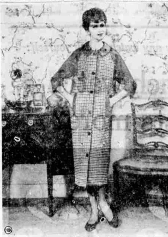
PLAIN AND PLAID ROBE-Robe for Christmas giving is this one in washable Cone corduroy. Houndstooth check in red is set off by dolman sleeves and wide, flat collar in solid knit cotton.