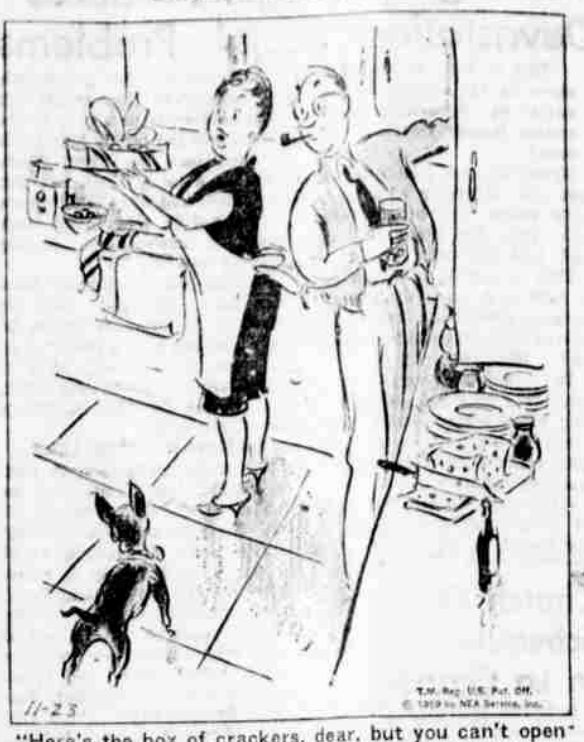
"Here's the box of crackers, dear, but you can't openit till after our club meeting. It's my entry in the gift wrapping contest!"