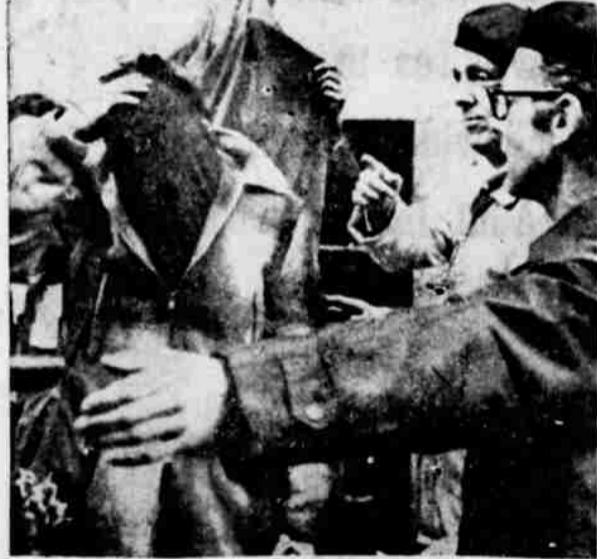
CAMERA-SHY—Beret-wearing narcotics squad detectives, disguised as beatniks, herd some camera-shy real beats into van in New York after their arrest on narcotics charges.

Dollars that will help support schools, roads and other local government operations were on the way to Union County this week as Idaho Power Company paid 1959-60 property-tax bills totaling nearly $355,000 in five Oregon counties.