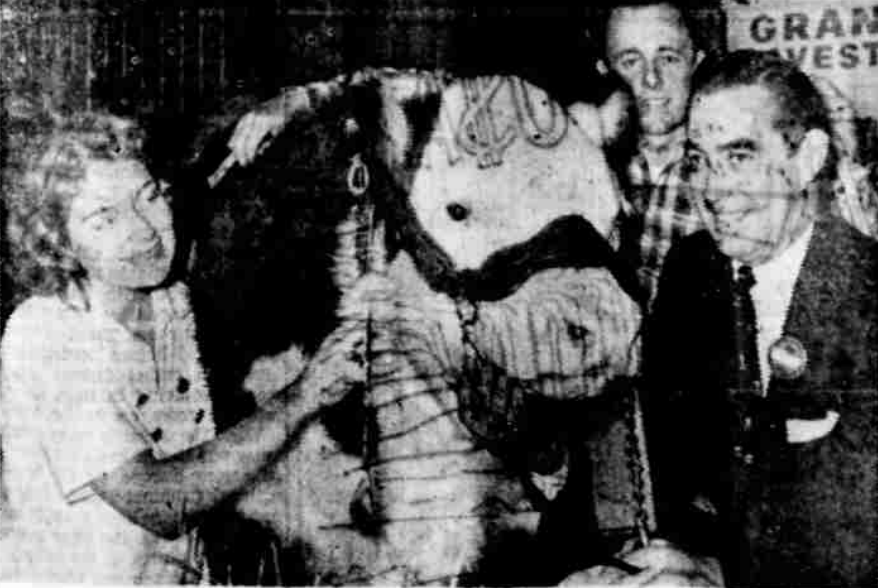
PRIZE BEEF—First animal to go on the auction block at Grand National Livestock Exposition at the Cow Palace in San Francisco, Calif. was "Tim Topper," a 1000-pound Hereford, Grand Champion Fat Steer of the show.