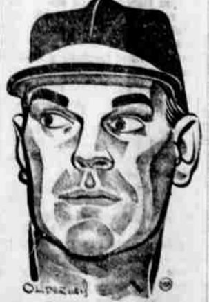
PAUL BROWN Favor From Redskins

The Eagles entertain a Cardinal team they edged earlier in the season, 20-24, after trailing 24-0 in the third period. The Rams-Lions clash also is a return match. The Lions upset the Rams at Los Angeles, 17-7.