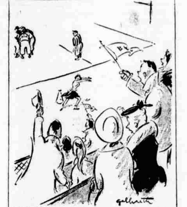
"Of course Judy has a good strong voice! She comes from a family of six children!"