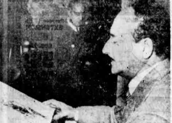
NOBEL WINNER —Salvatore Quasimodo, a left-leaning Italian poet, received the 1959 Nobel Prize for Literature, it was announced from Stockholm, Sweden. Quasimodo is the first Italian in 25 years to win the coveted literature prize.