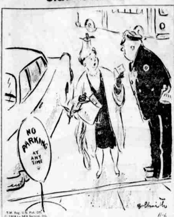
"Oh, here's my driver's license! It says I only weigh 110, but I always give myself a figure to shoot at!"