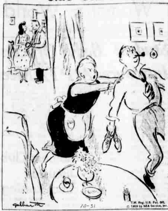
"Certainly a man's home is his castle, but how are you going to keep people out? Raise the drawbridge?"