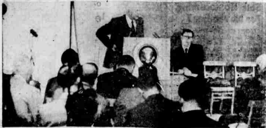
PRESS CONFERENCE —President Eisenhower informs newsmen that he still strongly favors a Western Summit Conference as soon as possible, but that he does not feel the same sense of urgency about a full scale summit meeting with Soviet Russia. During the same press conference at the Richmond Hotel in Augusta, Ga., he said he believes American self discipline rather than such laws as the Taft-Hartley Act should govern our labor-management disputes.