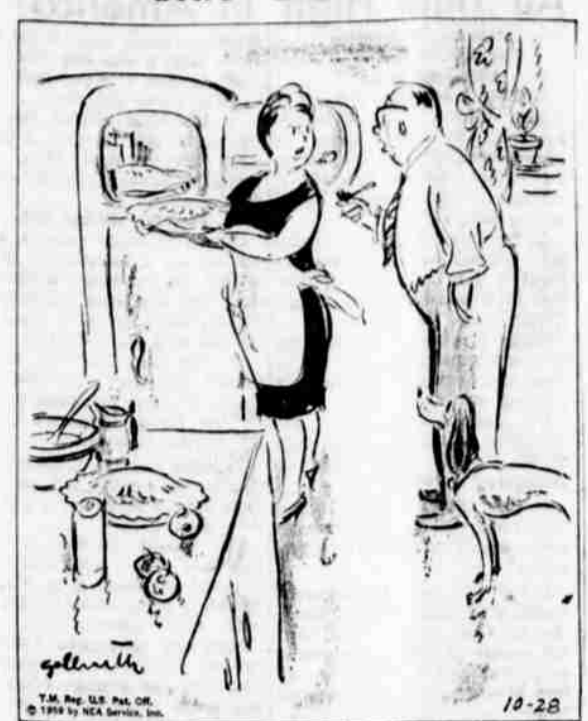
"But, dear, the company won't get here for two more days and I'm tired of peanut butter!"