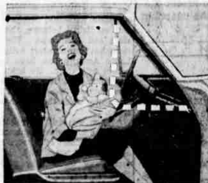
Goodbye to the dogleg in the doorway! Leave it to Ford to sweep that annoying windshield pillar forward, out of your way. No more bumped knees or snagged toes!

Electric Heaters ARVIN and LA SALLE AT LA GRANDE HARDWARE