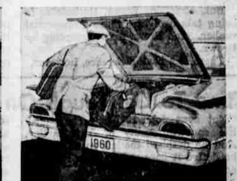
Even a child can load the trunk, thanks to its low level! The trunk lid is perfectly placed... just 27" above the street. Trunk holds 3 weeks' supply of luggage! Ford is built for people!