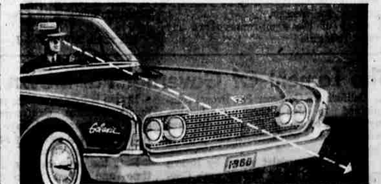
Oh, say can you see, with 55% greater sky-to-road vision. That sleek, sloping hood reveals more road than you've ever seen before. New Wide Angle windshield gives you up to 17% greater glass area. Wider angle of vision through rear window, too.