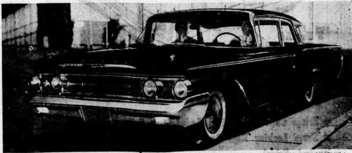
1960 Mercury Monterey 2-door Sedan with deluxe interior and complete carpeting at no extra cost.

*Based on manufacturer's suggested delivered price for a Monterey 2-door Sedan, 1960 - 1959.