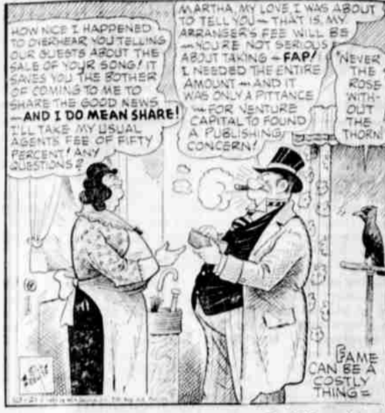
OUR BOARDING HOUSE