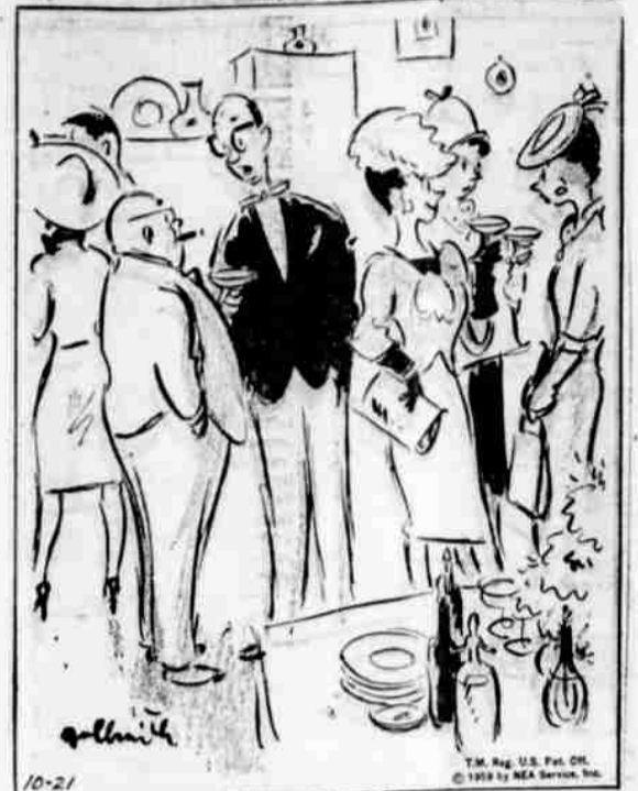
"Maude's operation wasn't so expensive, but she had to buy a lot of clothes to help her recover!"

NEW FARES ANNOUNCED LONDON (UPI) — The government-run British Overseas Airways Corporation will introduce low family fares on all trans-Atlantic flights this winter, officials said today.