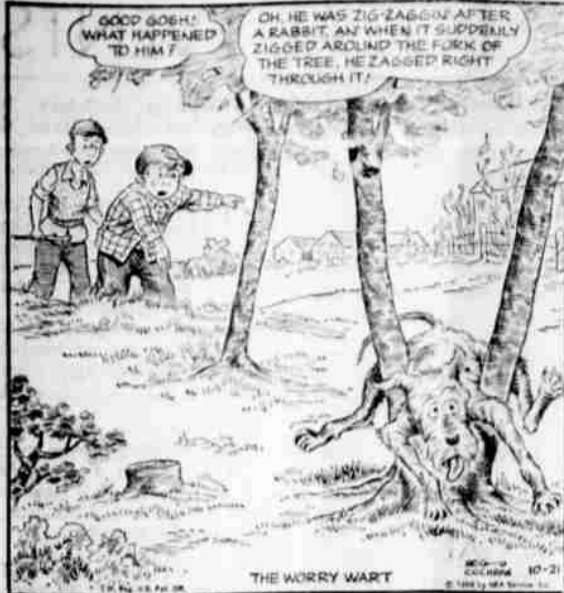
THE WORRY WART