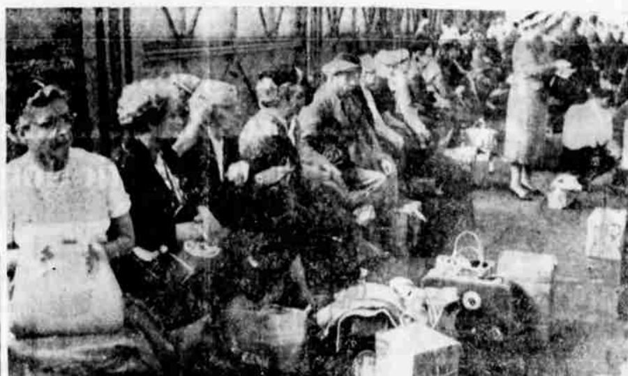
IMPATIENT WAIT —Sitting on the dock in New York City are passengers who de- barked from the Queen Elizabeth and now must sit out a long wait for their lug- gage. The Longshoremen's strike, which has tied up ports from Maine to Texas, has made it necessary for company personnel to do the loading and unloading of ships. President Eisenhower is expected to take action designed to speed up settlement of the paralyzing dock strike.