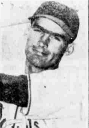
WALLY MOON Only Dodger Named

145 games, only one batted less than 300 and they totaled 248 homers—or an average of 31 apiece for the season. The complete voting position-by-position: Catcher: Del Crandall, Braves (21), Smokey Burgess, Pirates (2), Ed Bailey, Reds (1). First-Baseman: Frank Robinson, Reds, and Orlando Cepeda, Giants (10 each), Joe Cunningham, Cardinals (2), Joe Adcock, Braves and Gil Hodges, Dodgers (1 each). Second-Baseman: Johnny Temple, Reds (15), Charlie Neal, Dodgers (8), Don Blasingame, Cardinals (1). Shortstop: Ernie Banks, Cubs (23), Johnny Logan, Braves (1). Third-Baseman: Ed Mathews, Braves (18), Ken Boyer, Cardinals (6). Outfielders: Hank Aaron, Braves and Willie Mays, Giants (23 each), Wally Moon, Dodgers (10), Robinson, Reds and Vada Pinson, (5 each), Joe Cunningham, Cardinals (4), Gus Bell, Reds and Duke Snider, Dodgers (1 each). Pitchers: Sam Jones, Giants (21), Lew Burdette, Braves (12), Warren Spahn, Braves (9), Elroy Face, Pirates and Johnny Antonelli, Giants (3 each).