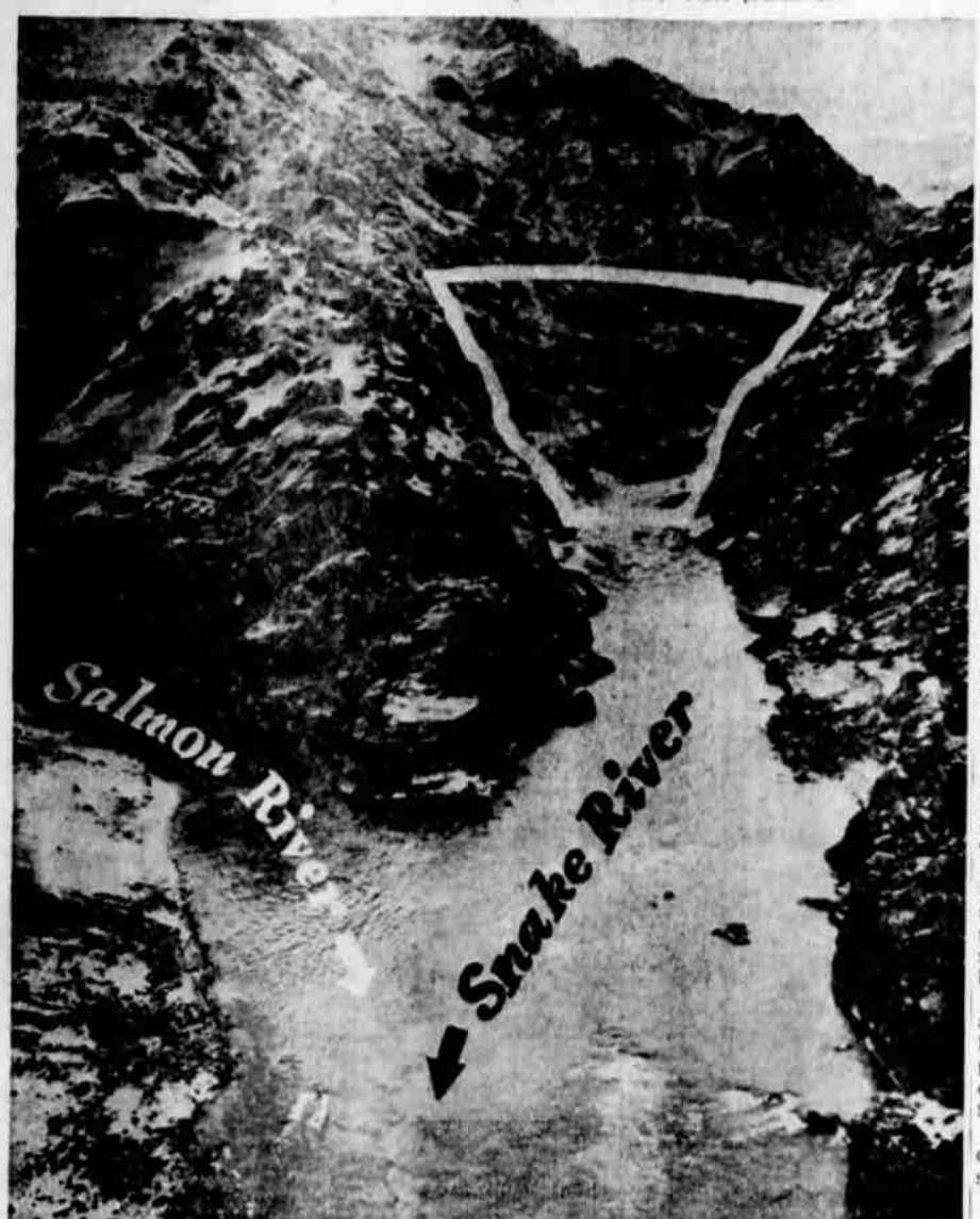
MOUNTAIN SHEEP DAM

DACCA, Pakistan (UPI)—At least 300 persons died within the last few days in a widespread outbreak of cholera in the district of this capital of East Pakistan, unofficial reports showed today.